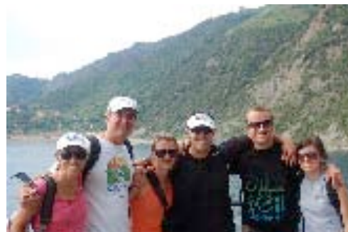
By the Mediterranean Sea