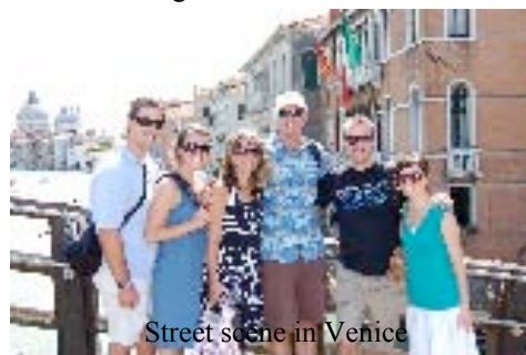
Street scene in Venice